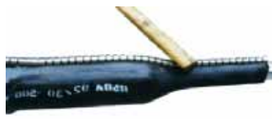
Tap channel down to conform to cable.