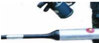
Flame brush the cable.