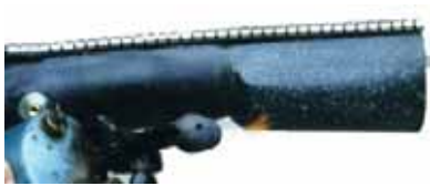
Completed sleeve installation.