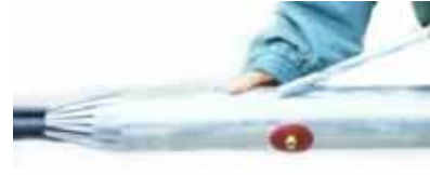
Center the metal canister over the splice. Seal the canister in right place with aluminum for strip.