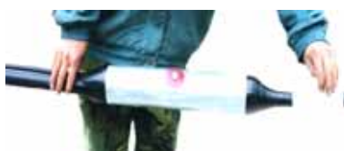
Clean the cable sheath at least 100mm from canister with tissue.