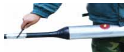
Wrapping the aluminum foil strip over the mark.