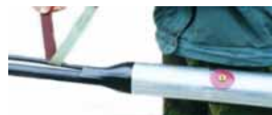
Abrade the cable sheath circumference on the cleaned area with abrasive strip.