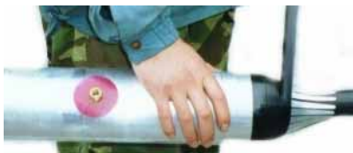
Tightly wrap one half-lapped over canister with adhesive tape.