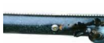
Continue heating evenly around sleeve from center to end until entire sleeve is Recovered.