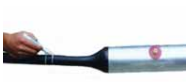
Make another mark inside of first one about 10mm.