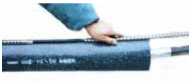
Slide on channel.