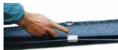
Install under clip on the middle of the sleeve.