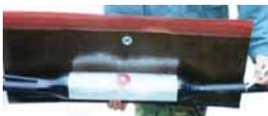
Place a mark on the cable just outside of the edge of sleeve.