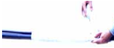
Tightly wrapping closure