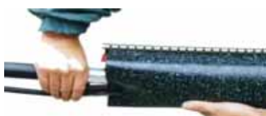
Install branch off clip slipping clip over sleeve as far as possible.