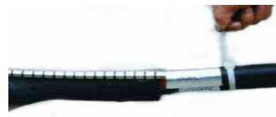
Strain cable with wrap.