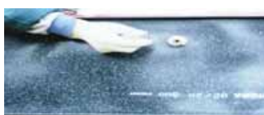
Installing the shrinkable sleeve, line sleeve up with mark on cable.