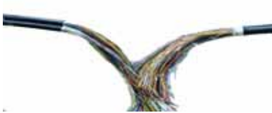
Prepared cables, cut and removed cables Sheath.