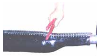
Tap channel down to conform to cable