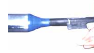
Wrapping aluminum foil strip over mark 10mm