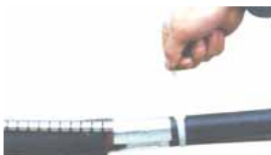
Strain cables with tie wrap