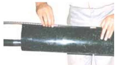
Slide on channel