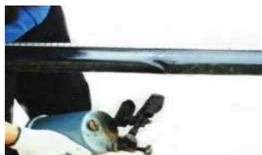
Continue heating evenly around sleeve from center to end until entire sleeve is recovered