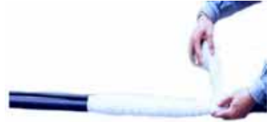
Attach shield continuity wire to cable sheath with clip.