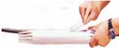
Center the metal canister over splice, Seal canister in right place with aluminum foil strip