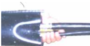
Install branch clip slipping clip over sleeve as Far as possible