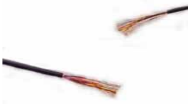
Prepared cables, cut and remove cable sheath