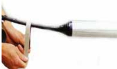
Abrade the cable sheath circumferentially, on the cleaned area with the abrasive strip