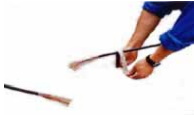
Abrade the cable, wrap several layers of PVC tape over cable, Strain the end cable