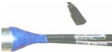
Flame brush cable