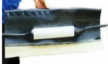
Place a mark on the cable just outside the edge of the sleeve