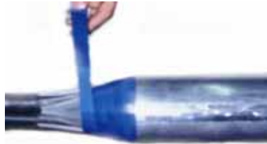
Tightly wrap one half-lapped over canister with adhesive tape