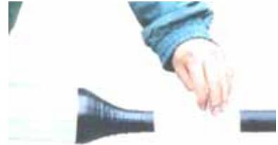
Clean cable sheath at least 100 mm from canister with tissue