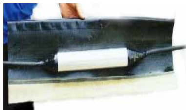
Installing shrinkable sleeve, line sleeve up with mark on cable